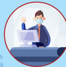
Transparent Protective Screen in Customer Service Desks