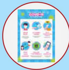
Awareness/Safety posters placed at branches