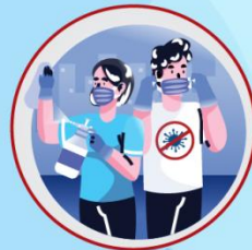
Continuous sanitization at branches