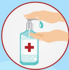
Provision of Hand Sanitizers