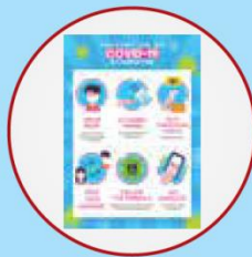
Awareness/Safety posters placed at branches