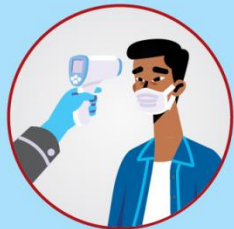
Mandatory Thermal Screening for Employees

To ensure your safety at our branches, we are taking extra precautionary measures against COVID-19