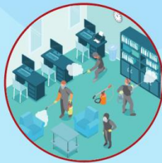
Fumigation/Sanitization of branches if COVID is detected